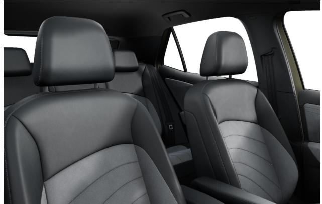
Artvelour Seats Dusty Grey/Dark Soul Black Standard on ID.3 Pro S - option on Pro with Interior Package