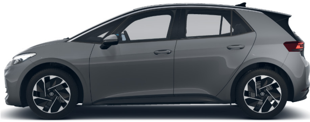
Moonstone Grey Solid C2A1