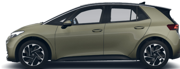
Dark Olivine Green Metallic** H0A1