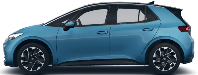
Costa Azul Metallic** 3KA1