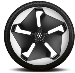
STANDARD ON ID.3 Pro S Plus 20" 'Sanya' alloy wheels 7.5J x 20 Tyres: 215/45 R20